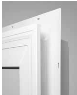
1900 Series Single-Hung with Nailing Fin and Integral Brickmould J-Channel