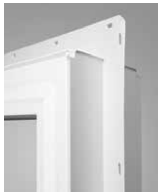
1700 Series Single-Hung with Nailing Fin

Choose from a variety of frame options to help streamline jobsite requirements for every type of construction, cladding and masonry projects. Gentek new construction windows are designed to simplify the contractor and builder experience by meeting today's design trends with ease.