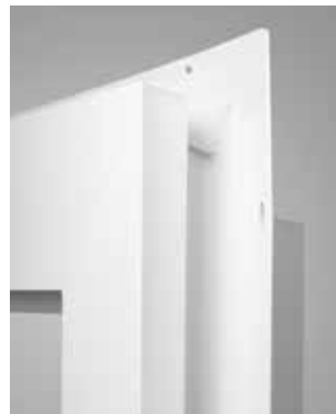
1900 Series Double-Hung with Nailing Fin (shown with optional 3-1/2" flat casing)