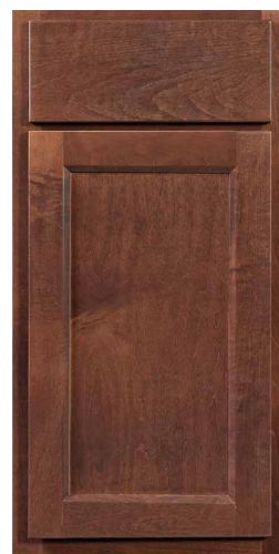
Harvest Brown Stain