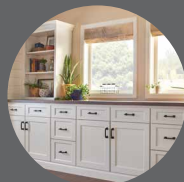
Kitchen & Bath

For a complete line of Wolf products, including these items and more, please visit our website.