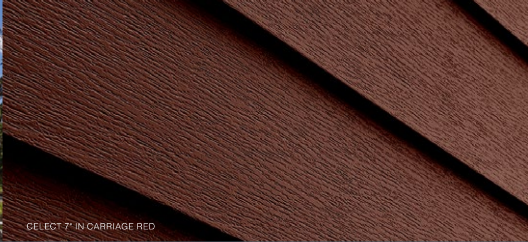
CELECT 7' IN CARRIAGE RED