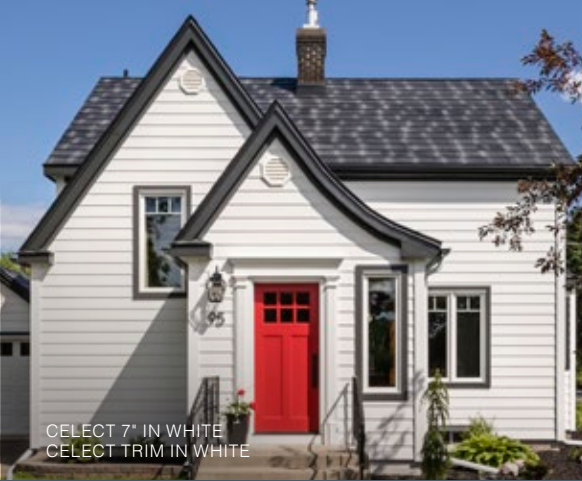
CELECT 7' IN WHITE CELECT TRIM IN WHITE