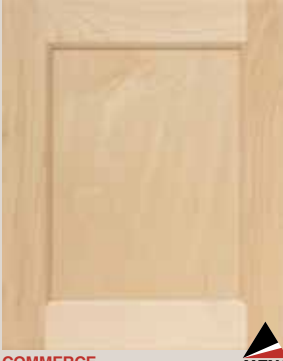
COMMERCE Available in these wood types: C5 | M3 | O2 Drawer header is slab Optional five-piece drawer header Standard edge is L