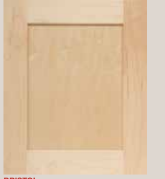
BRISTOL Available in these wood types: C2 | M2 | O1 Drawer header is slab Optional five-piece drawer header Standard edge is L

STRATFORD Available in these wood types: C3 | M2 | O1 Drawer header is slab Optional five-piece drawer header Standard edge is F