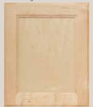
SOMERSET TRADITIONAL OVERLAY Available in these wood types: C2 | M2 | O1 Drawer header is slab Standard edge is F