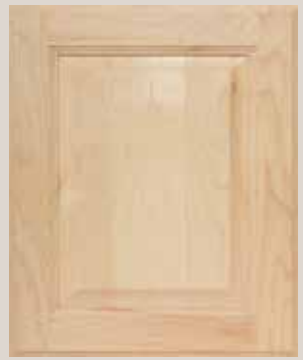
TREMONT TRADITIONAL OVERLAY Available in these wood types: C6 C6 M6 O2 Drawer header is slab Standard edge is F