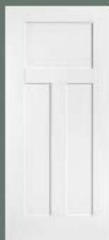
*3-Panel Craftsman Flat