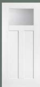
*3-Panel Craftsman Flat