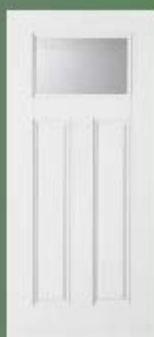
3-Panel Craftsman Raised