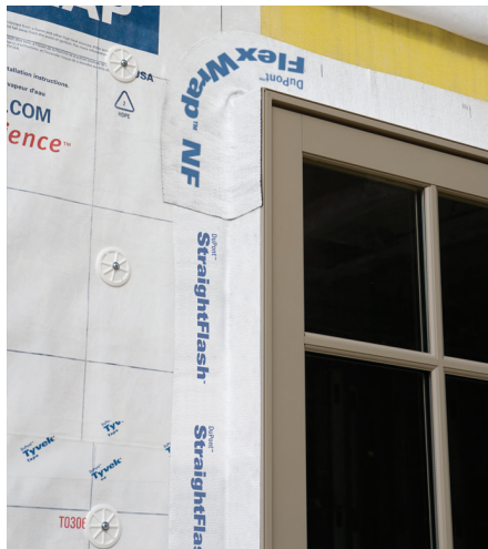
DuPont™ FlexWrap™ NF and DuPont™ StraightFlash™ are designed to be compatible with DuPont™ Tyvek® Air and Water Barriers.

DuPont™ Tyvek® Commercial Air and Water Barrier Systems offer the superior durability needed to hold up to the rigors of a commercial job site and are designed to work together to help seal the building envelope, creating more durable, comfortable and energy-efficient structures. By controlling airflow, holding out bulk water and allowing interior moisture vapor to escape from the wall cavity, Tyvek® Commercial Air and Water Barrier Systems can help reduce the energy needed to heat and cool buildings; protect against mold growth and water damage; and help to create healthier and more comfortable indoor air environments. Using Tyvek® Commercial Air and Water Barrier Systems may help contribute toward U.S. Green Building Council LEED® points.