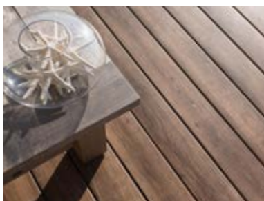
ZURI® PREMIUM DECKING