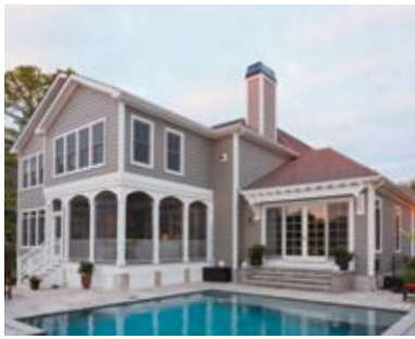
CELECT® CELLULAR COMPOSITE SIDING