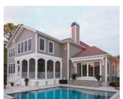
CELECT® CELLULAR COMPOSITE SIDING